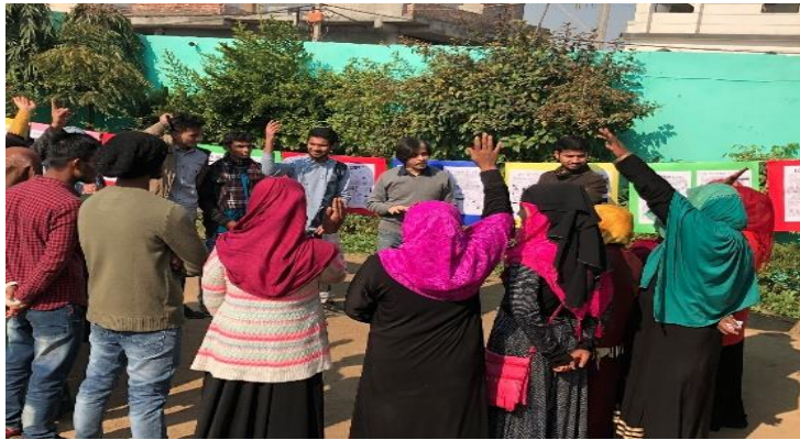
© 2019, Rohingya Human Rights Initiative

The beneficiaries of our project are invited to work as peer mobilizers with our organisations and build awareness on human rights issues , including on gender-based violence, with others in the community. Their efforts and participation in community matters creates a shift in power