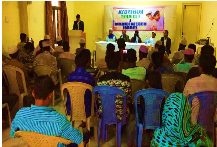
© 2019, Rohingya Human Rights Initiative

Human rights can only be achieved through an informed and continuing demand by people for their protection. Human rights education promotes values, beliefs and attitudes that encourage all individuals to uphold their own rights and those of others. It develops an understanding of everyone's common responsibility to make human rights a reality in each community.