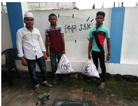
© 2019, Rohingya Human Rights Initiative

Emergency relief response provided shelter, food, water, clothes, food commodities, medical care, sanitation, stationaries for school-going children and financial aid to re-establish livelihoods. We provided food, blankets and water tanks in Jammu and Faridabad, especially to fire victims and to the jobless people, disable people patient and elderly people. Out of other individual activities under emergency and relief support, ROHRingya provided