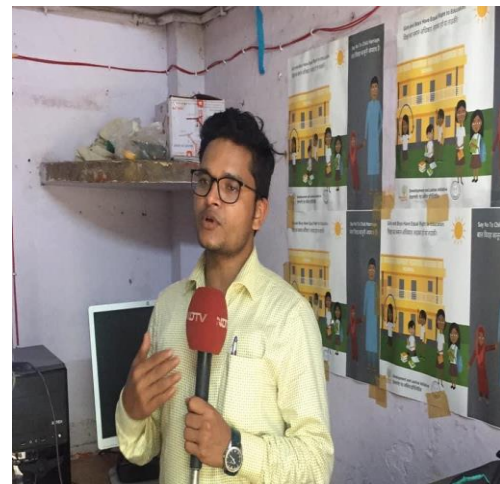
© 2019, Rohingya Human Rights Initiative