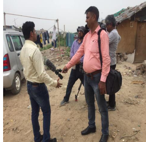
© 2019, Rohingya Human Rights Initiative

The humanitarian crisis caused by escalating violence in Myanmar's Rakhine State is causing suffering on a catastrophic scale for the Rohingya community. Over 700,000 Rohingya have fled from Myanmar to Bangladesh since 25 August 2017. Thousands more reportedly remain stranded and in peril in Myanmar without the means to cross the border into Bangladesh. Refugees arriving in Bangladesh, mostly women and children are traumatized, and some have arrived with injuries caused by gunshots, shrapnel, fire and landmines. Humanitarian partners continue to scale up operations, but additional resources are urgently needed. The Rohingya Human Rights Initiative regularly issues press statements to news channels and newspapers to highlight the continuing human rights abuses in Myanmar and to generate support for greater action to help the Rohingya community. We also organize conferences and run campaigns to draw attention to the plight of the Rohingya and partner with human rights organizations and other institutions with the same goal.